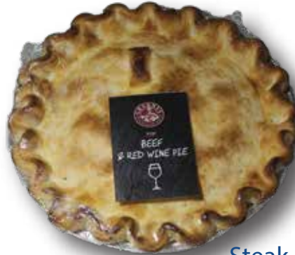
Steak & red wine