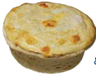
Beef, bacon & cheese pie