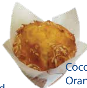
Coconut, Orange & White Choc