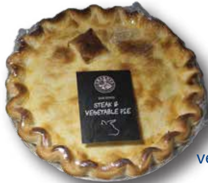
Steak & vegetable