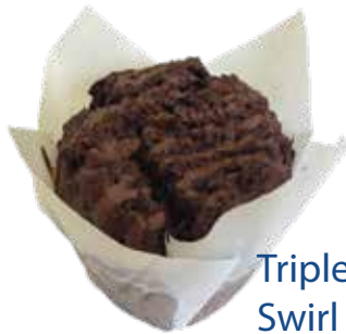
Triple Choc Swirl