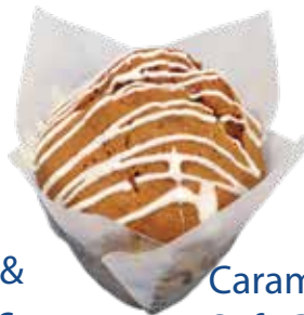
Caramel Soft Centred