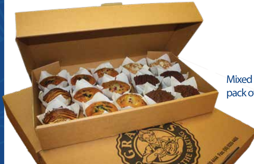
Mixed 15 pack of barista muffins