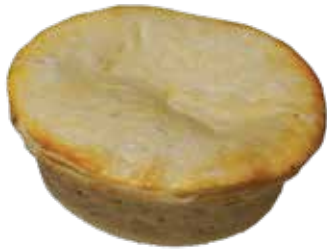
Classic aussie pie