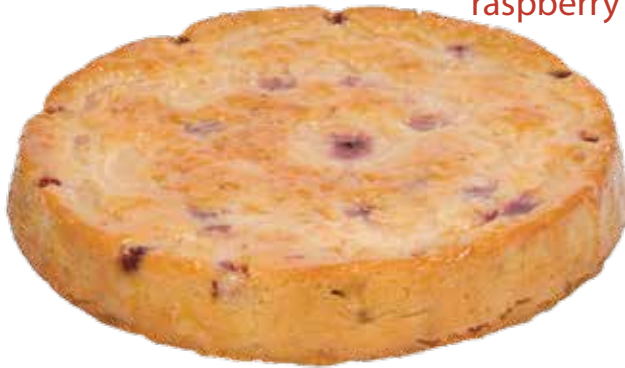
Gluten Free pear & raspberry