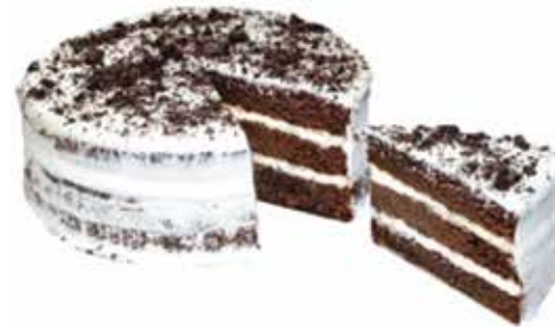
Cookies & cream