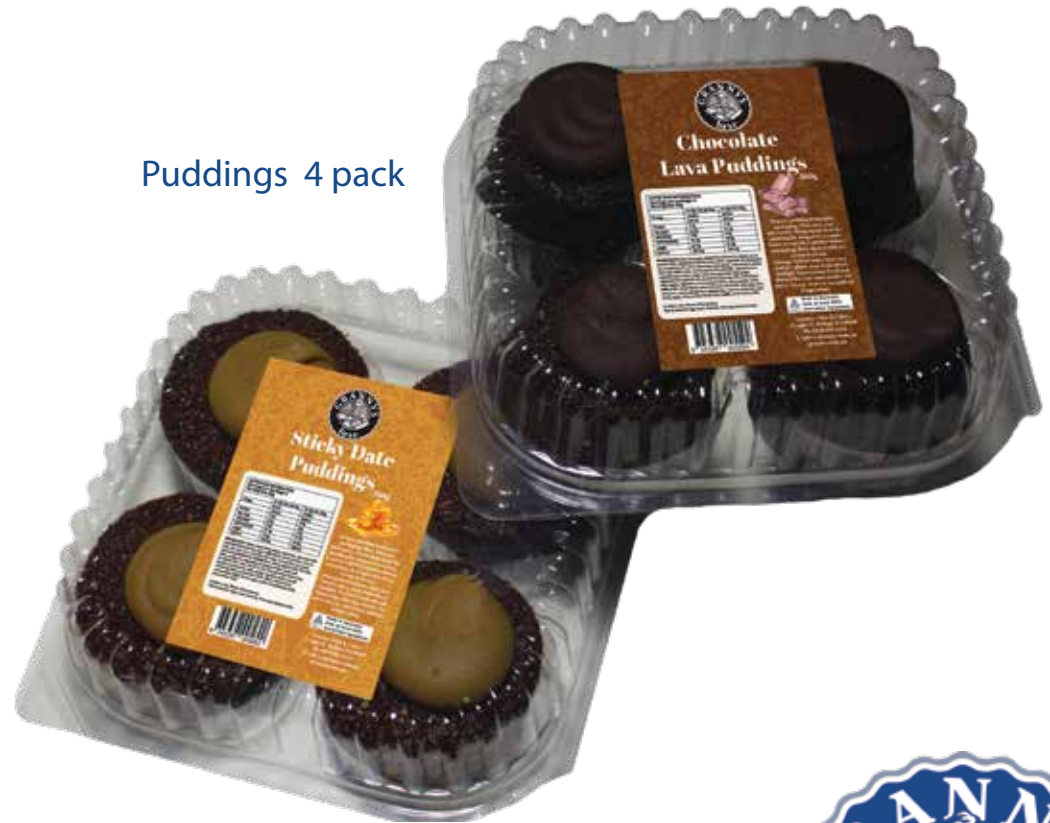
Puddings 4 pack