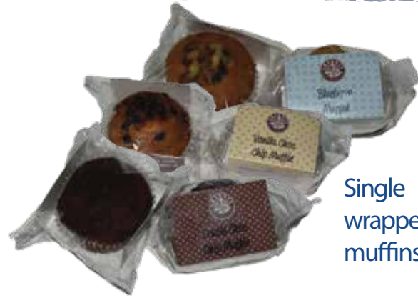
Single wrapped muffins