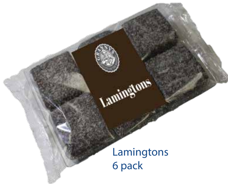
Lamingtons 6 pack