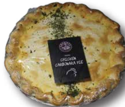
Chicken, mushroom & bacon