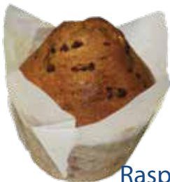
Raspberry & White Choc