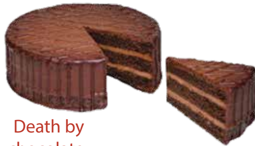
Death by chocolate