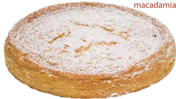
Gluten Free mango & macadamia