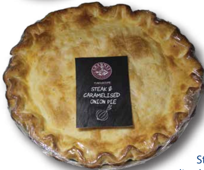
Steak & caramelised onion