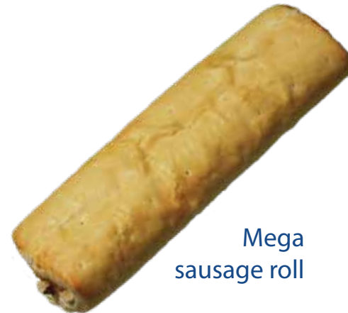
Mega sausage roll