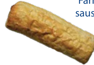
Farmhouse sausage roll