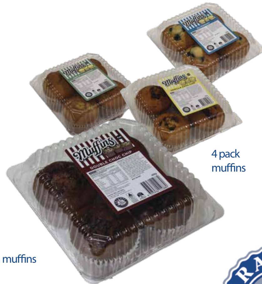
4 pack muffins